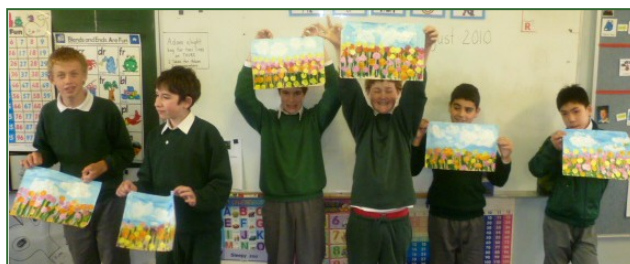
Class JR showing their beautiful "Field of Flowers" paintings.