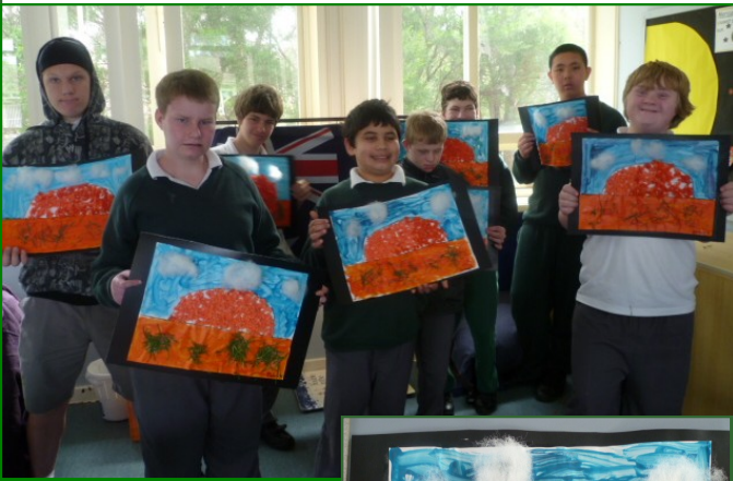
Class G with their very creative pictures of Uluru.

We used crepe paper for the rock, cotton wool for the clouds and real grass for the shrubs!