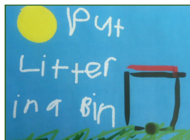
Larna's computer art on not littering.

They are holding up their computer art showing how we can help be friendly to our Environment