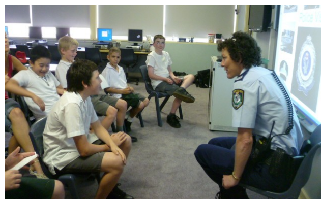
This term Class C are learning about 'Emergency Services'.