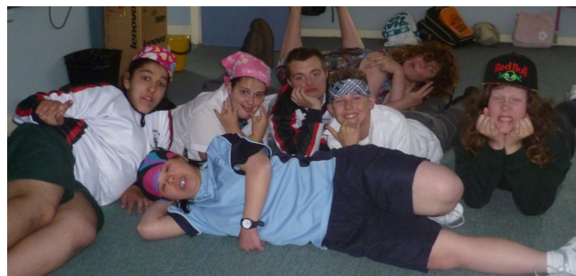
Class D celebrating CanTeen's Bandanna Day!