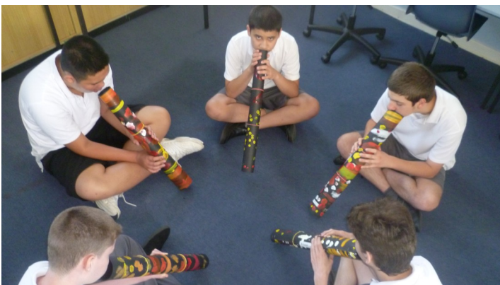
Students playing their didgeridoos that they made for Aboriginal Studies.