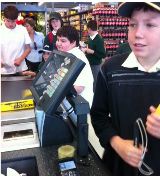
Shopping skills at the Supa Barn.