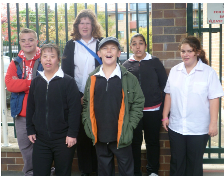
Class D students heading off to Work Experience for 2011!

He is enjoying the fruit kebab he made in cooking. Yum!