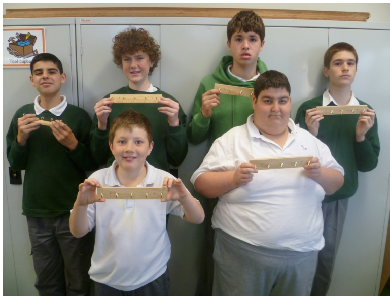
TAS students have Completed their Key Holders !