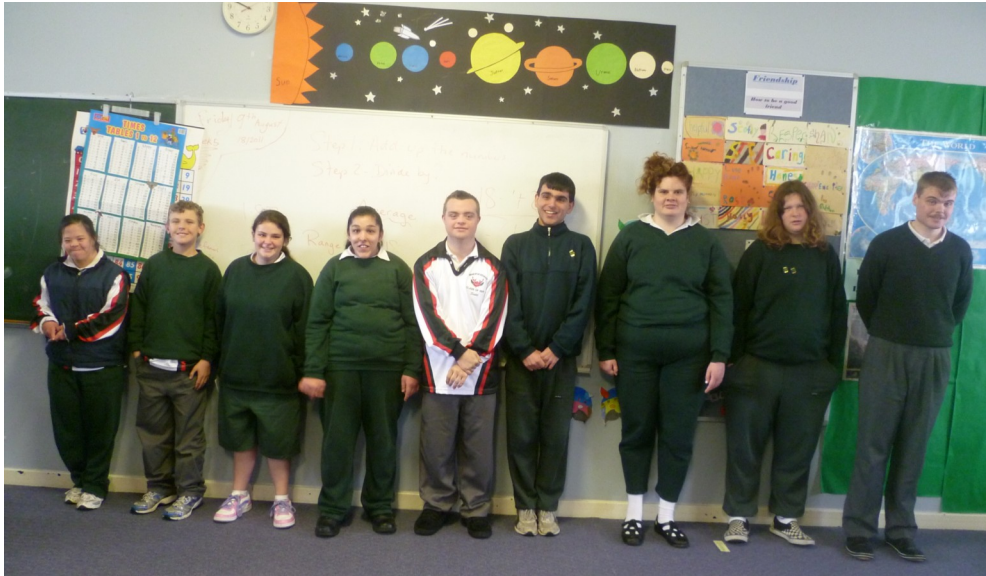
Class D calculated the average height of students is 1.64 metres