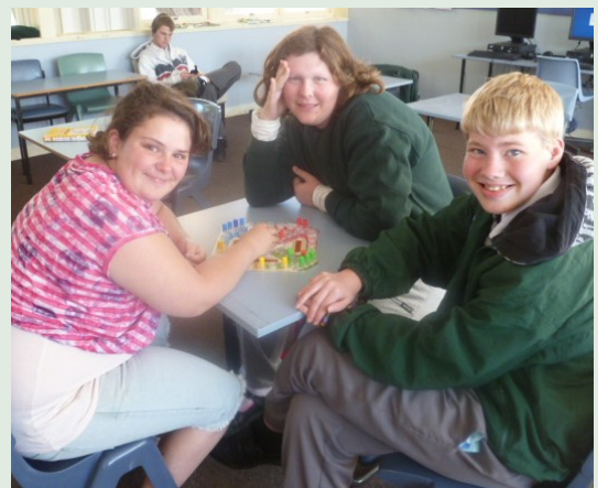
Playing/causing Trouble !