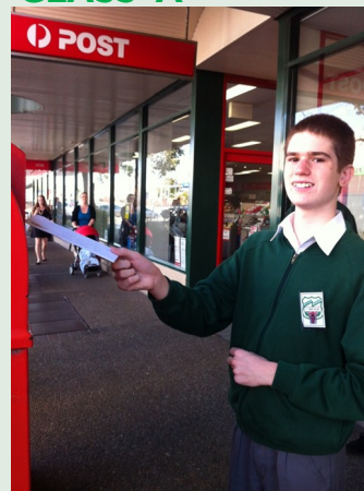
Class A at the Post Office. One of the many sites visited on community access.