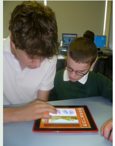
Class M students are enjoying learning on the iPads.