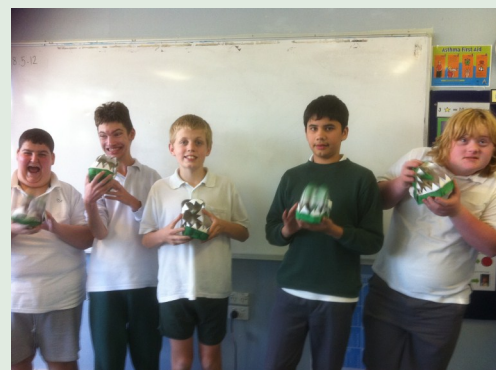
Class S with their snappy crocodiles!