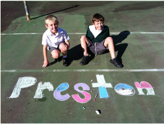
Class L showing off their chalk drawings.