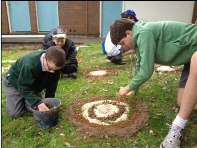
Students from class M..... happy to get their hands dirty!