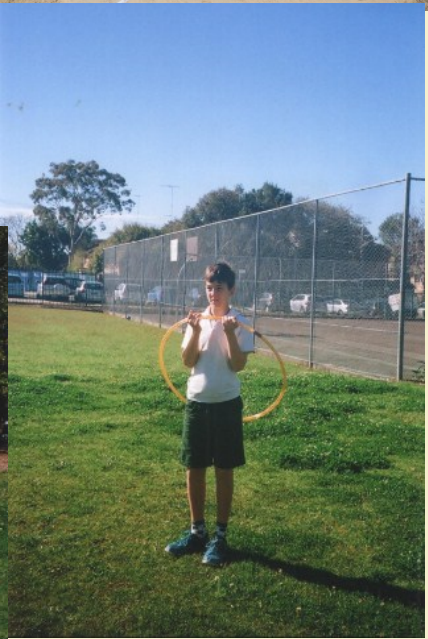
Some pictures from both our Combined Schools and InSchool Athletics Carnival