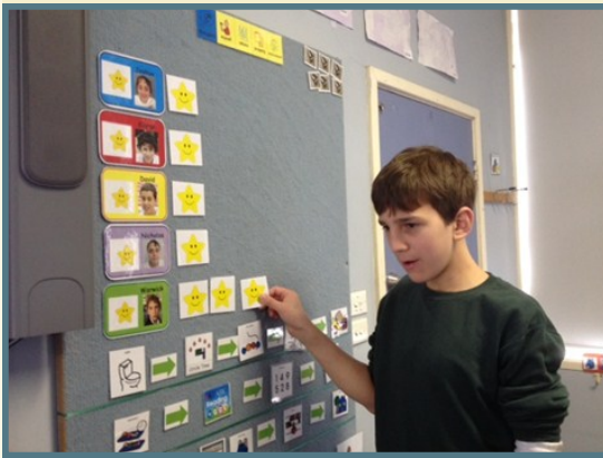
Warwick enjoys getting Stars for Good Choices